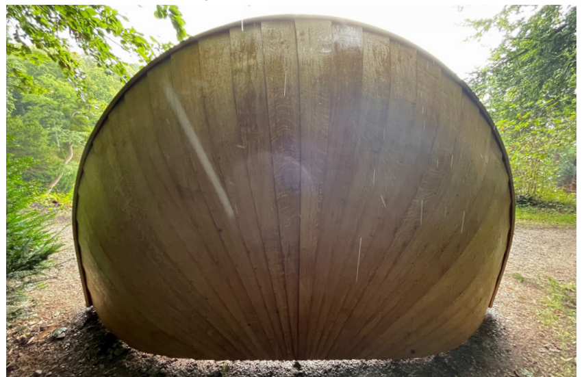
4 The Terrace Seat is a renewed resting place in the C18 English Landscape Garden at Hestercombe, overlooking the Pear Pond.