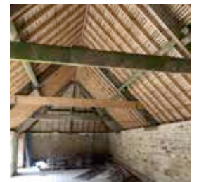
7 Conservation, repair and comprehensive rejuvenation of a vernacular Cotswold manor house, with a 900 year history, to make suitable as a 21 st century home.

The Norman Hall, Old Stables, Ambulatory and garden have been opened to the public.