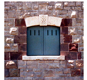
2 Brean Down Fort was one of four Napoleonic/ Palmerston gun emplacements that protected the Severn estuary. The down itself is a SSSI site.

The buildings became ruinous after WW2 and have been consolidated, repaired and made safe, with improved access and new interpretation panels describing the history, fauna and flora.