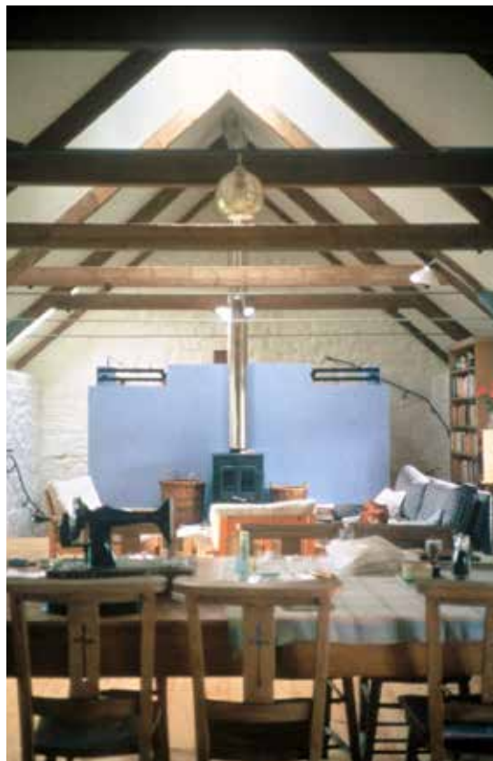
3 original shell, such as the ground floor timber walls, and the core for the stair, study and fire place.

Independent elements were inserted into the