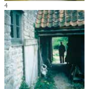
5 1 Mill barn 2 Entrance hall 3 First floor living space with the study and fireplace core at the far end 4 Inserted timber walls 5 Original byre forms the porch to the front door