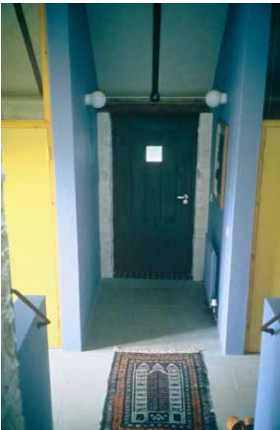
2 Repair and conversion of a 19 th c barn into a house.

The main living spaces are on the first floor, within the roof space, to take advantage of the view from the old loading door. The bedrooms and bathroom were enclosed by the old walls on the ground.