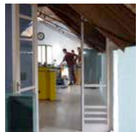
4 A 1906 listed barn, converted to open living areas and entrance court, with ground floor bedrooms.

All new partitions are differentiated by contrasting materials and colours to maintain the quality of the original spaces and surfaces.