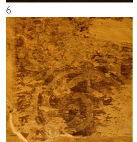
7 1 Inglesham Church 2 South porch 3 Repaired north door 4 East end 5 Chancel 6 17 th c glass 7 Medieval wall painting