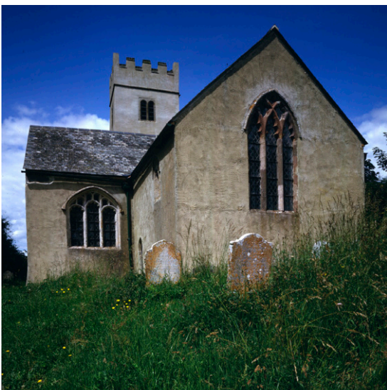
4 Inglesham is a medieval church. It was an early SPAB case on which William Morris worked.

Thorough phases of repair have been achieved which were highly complex to retain the original fabric as found. It involved wall painting conservation, stone tiled roofs, structural tying, conservation, masonry repairs, and ground drainage.